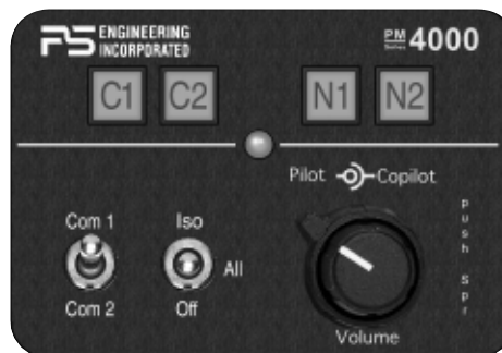
Shown actual size

An optional internal digital recorder (p/n 11941) can provide up to one minute of stored aircraft radio reception. This device is a continuous loop recorder that automatically starts recording the instant a radio transmission is received, with no dead air time recorded. By pressing a momentary switch, the last recorded messages will be replayed. Up to 16 messages (or 1 minute) can be stored.