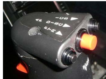
Figure 2 - FTR Switch and AP DISC Switch

When pressing and holding the trim switch, all force is removed from the cyclic. Upon subsequently releasing the trim switch, all force is then reapplied to the cyclic. For this reason, the sequence of pressing and releasing the trim switch is also referred to as activating Force Trim Release (FTR).